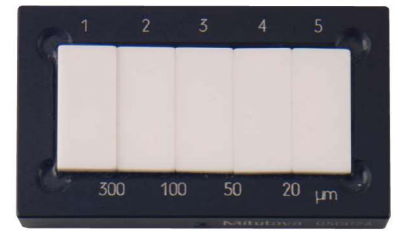
Ceramic type 516-499